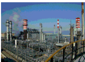
api refinery site in Falconara Marittima, Italy.