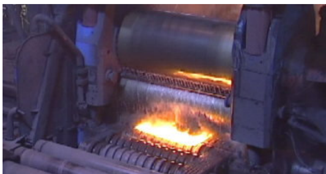
Outokumpu Degerfors, Sweden

“ABB gives us a new way of thinking about maintenance and a new perspective on problems.”